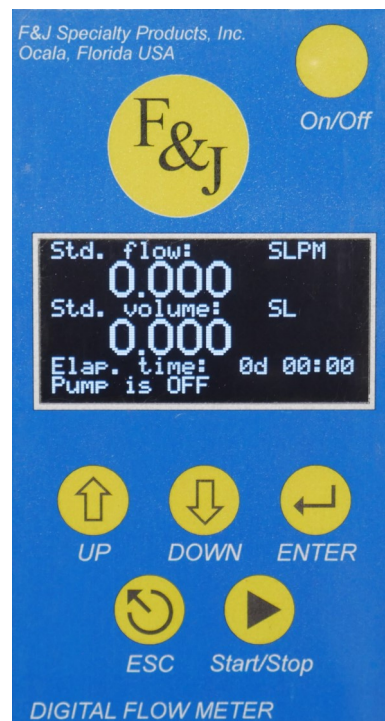
DFM Main Screen Display

The typical operating flow range is 0.5 to 4 CFM (14 – 115 LPM).