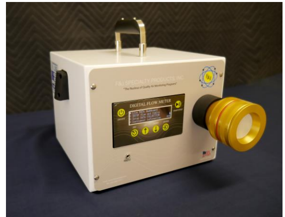
Shown with optional filter holder