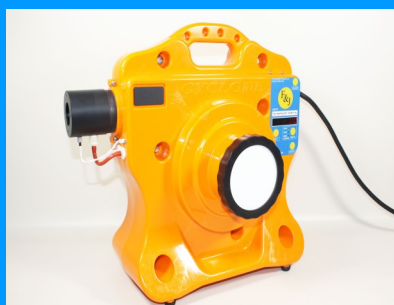
ULTRA High Volume Portable Grab Sampler DFHV-200E Series