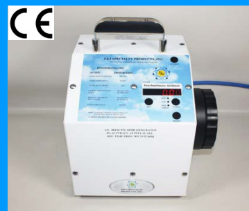
Brushless High Volume Grab Sampler DFHV-1S-BL-TE Series