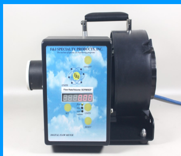
Portable Grab Sampler DF8400E Series