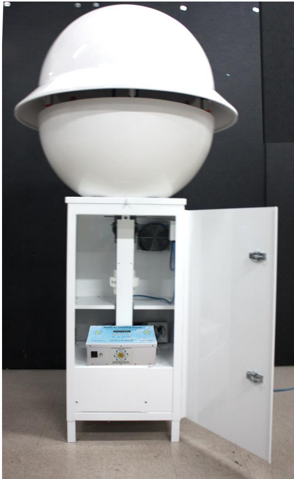
Frontal View – Sample Inlet Closed