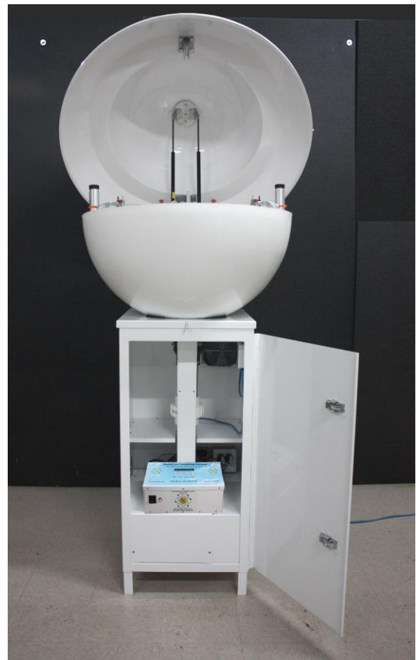
Frontal View – Sample Inlet Open