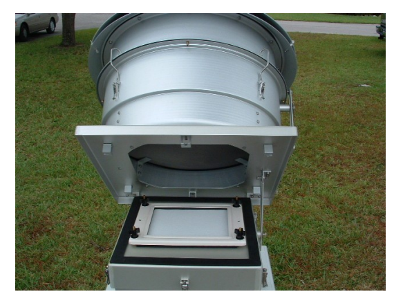
GAS-PM2.5DTE Series System PM2.5 Inlet Open Position for Access to Filter Paper