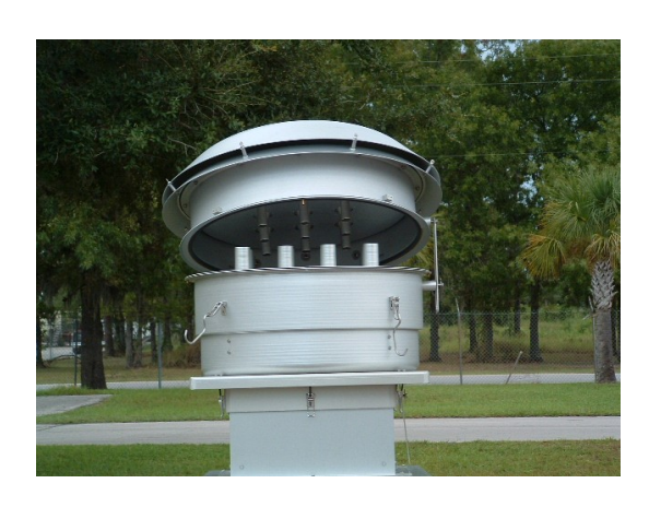
View of PM2.5 Size Selective Inlet illustrating interior features