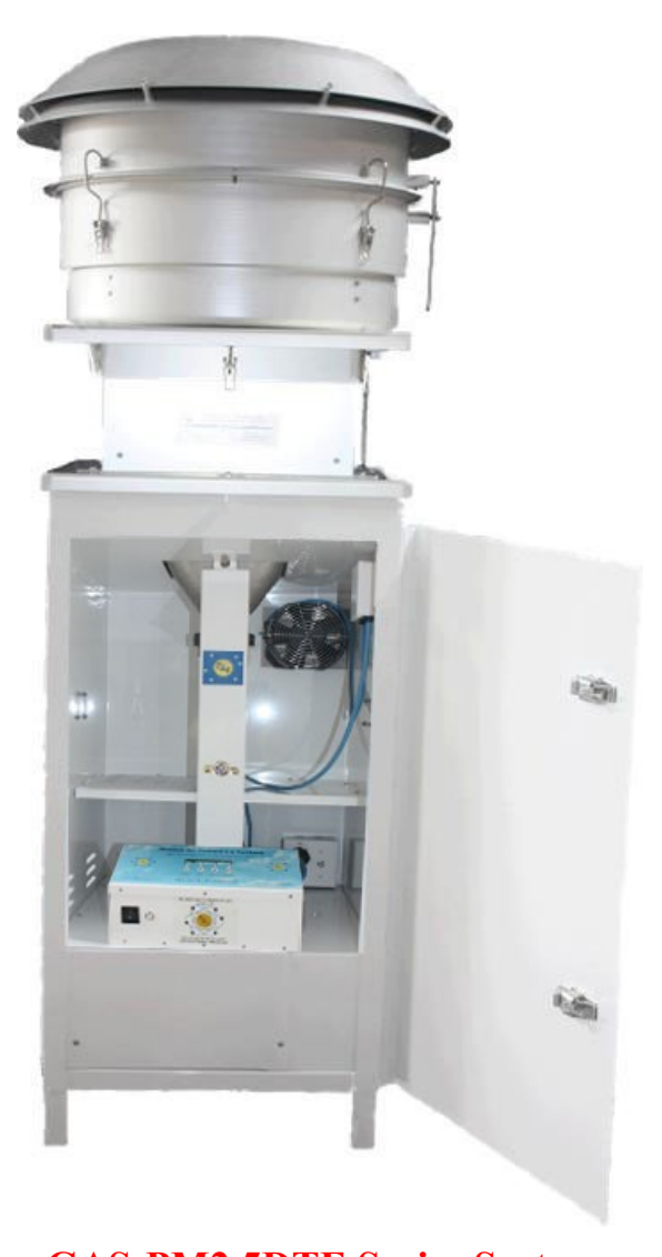
GAS-PM2.5DTE Series System Enclosure Door Open