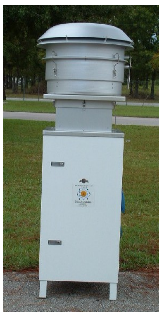
GAS-PM2.5DTE Series System Normal Operating Scenario